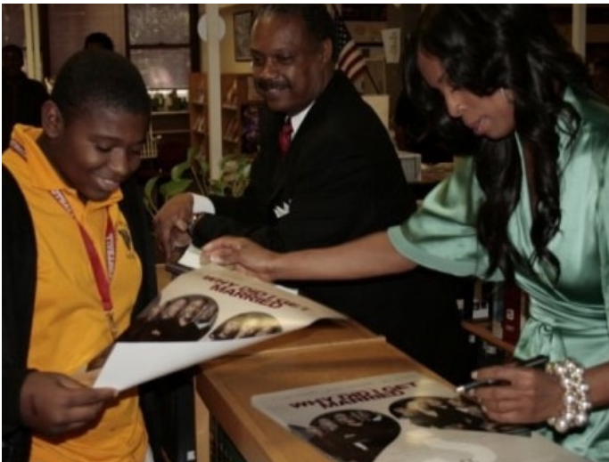
Actress and Camden native Tasha Smith (far right) signs copies of posters from her latest movie Tyler Perry's "Why Did I Get Married?" for Camden High School students.