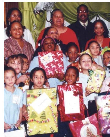
Fifth floor staff members pose with Lanning Square students after receiving their gifts.

This year's gift giving and holiday program was designed by the superintendent to promote holiday spirit among staff and students.