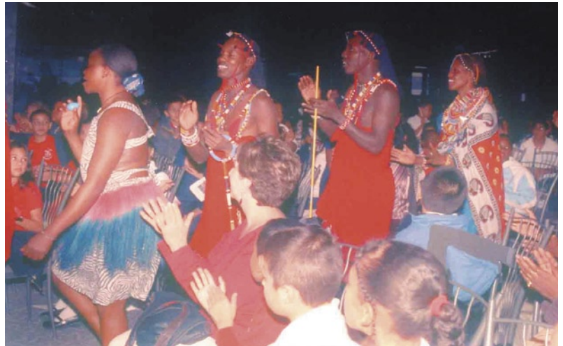
Fourth grade students clap to a beat as the Sironka African Dance Troupe marched down the aisle. Wearing colorful costumes, the dancers were a big hit during their visit to Camden at the Adventure Aquarium.

The talented group of young Maasai dancers shared their culture and experiences while touring the United States. Dancers from the city’s Unity Community Center also performed for students.